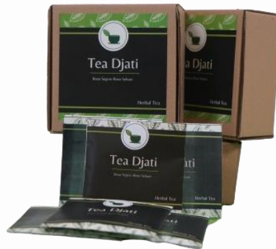
Figure 2. Teak leaf tea products

mixture was then introduced into tea bags, and the tea bags was put into envelopes. The outer packages was e-flute boxes that have been labeled (Figure 2).