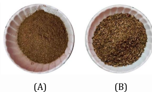
Figure 1. (A) Teak leaf powder passing the 40-mesh sieve; (B) Teak leaf powder that does not pass the 40-mesh sieve.

In this training, BUMDes Gajah Mada, Pokdarwis, and PKK firstly received guidance and explanations regarding the procedure for processing teak leaves into powder. The resulting powder was a fine powder that passes a 40-mesh sieve and a powder that does not pass the sieve (Figure 1). Afterwards, the powder was stored in airtight containers and silica gel was added to absorb moisture thus keeping the powder dry.