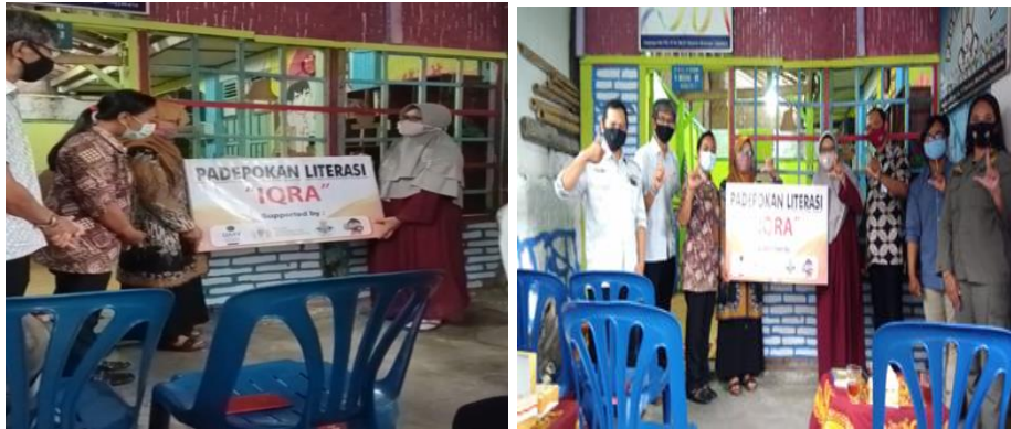
Picture 3. assigning of nameplate from PDNA to community