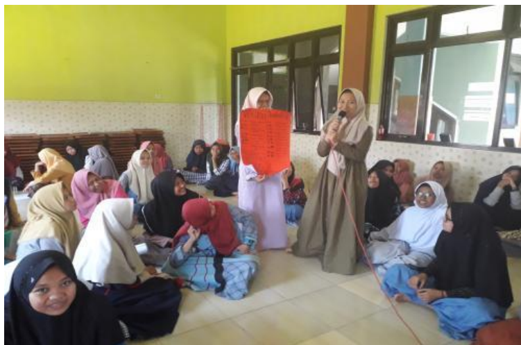
Figure.2 group 1