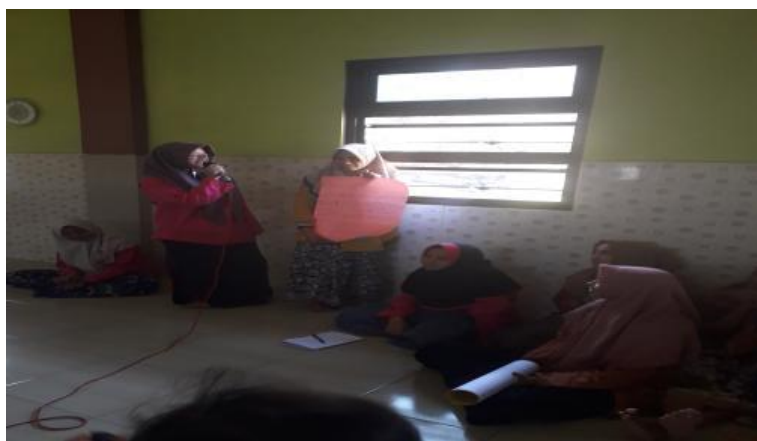
Figure 2. Group 2