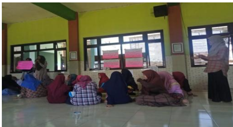
Figure 7.group 7