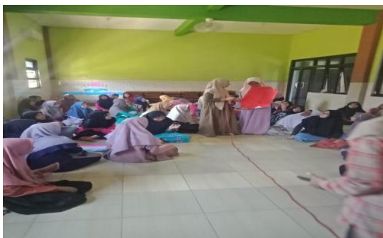
Figure 5.group 5