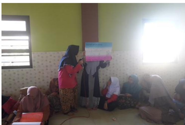
Figure 3.group 3