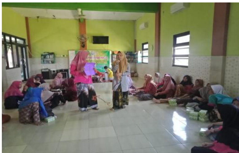
Figure 8.Group 8