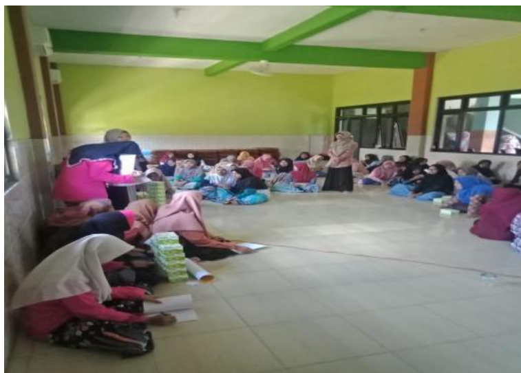
Figure 6.group 6

to 9:30 p.m. The moral message or meaning of life conveyed by the film is to avoid mocking and slandering others. Be willing to make sacrifices for your parents, don't be fooled by appearances, and don't be arrogant; patience and sincerity must be accompanied by wisdom.