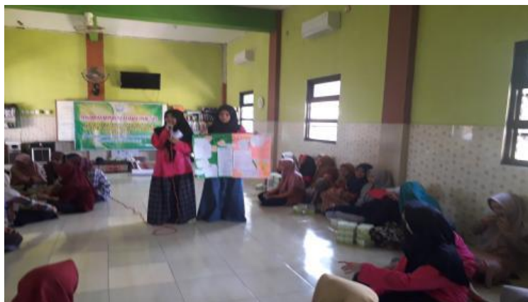
Figure 4.group 4

result, a solution is required, which includes reading books, summarizing the reading results, and posting them on social media platforms such as Instagram. Some of the information came from social media, and some came from his mother when he returned home from the pesantren due to illness, he explained. After that, he was discussed with his roommates.