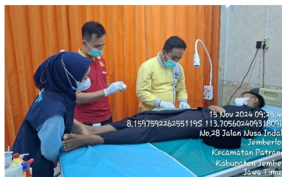
Figure 3. Direct Checking by Medical Personnel at ABH accompanied by Keris WeSave and Yayasan Sahabat Rengganis

Acting as a broker and facilitator, Keris WeSave connects and facilitates an ABH who has a broken hand with the Sahabat Rengganis Indonesia Foundation so that ABH can get access to health services as it should. Yayasan Sahabat Rengganis Indonesia then checked and together with Keris WeSave assisted ABH to get access to health services. Starting from checking whether ABH is a BPJS participant, then registering ABH at the hospital and getting an examination from the medical team. Figure 3 is a documentation of the condition of ABH's hand being examined by the medical team. The results of the examination recommended that ABH needed to undergo surgery or surgery on his broken hand.