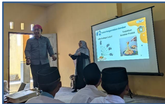
Figure 5. Digital Marketing Training Atmosphere

Not only material and motivation. Participants were given training on how to take product photos in the right position to get attractive photos and make persuasive captions so that potential buyers are more curious and want to order ABH products.