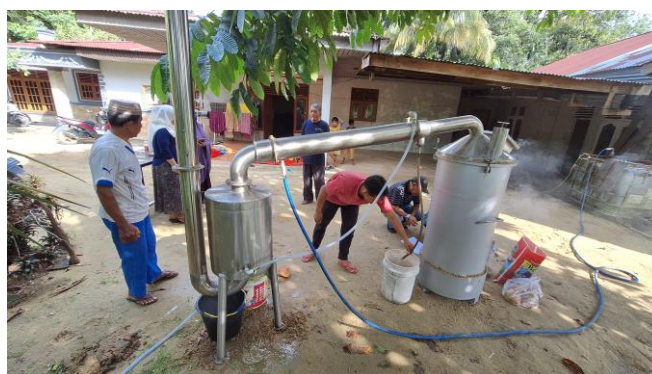
Figure 3. Pyrolysis Equipment

The pyrolyzer in this study was designed as a set of tools to produce liquid smoke with the working principle of the smoke gas phase produced in biomass combustion being converted into a liquid phase. This set of tools is made into one series in a table measuring 122 cm x 61 cm x 40 cm which is equipped with 4 wheels. This design makes it easy to transport the device. The portable pyrolysis tool designed in this study has 5 main components, namely the reactor, distribution pipe, condenser, control panel, and furnace/stove. The portable pyrolyzer tool set can be seen in Figure 2 .