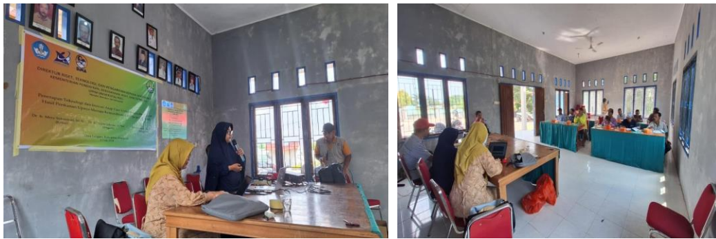
Figure 2. CPPB-IRT Training for Smoked Fish Processing Group