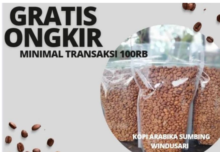
Figure 4. The old logo for Giyanti coffee for MSMEs on the slopes of Mount Sumbing, Magelang

By paying attention to the importance of color selection in logo design, giyanti coffe MSMEs can increase the visual appeal of their products, create a strong brand identity, and differentiate themselves from competitors in the market. This will help increase brand recognition and form stronger relationships between brands and consumers, which in pair can support long-term business growth.