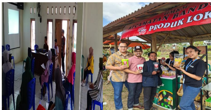
Figure 3. The process of planning and implementing the strategies

In this context, the main aim of the offline problem and goal identification meeting is to identify the challenges faced by giyanti coffe MSMEs and set a clear direction for further development. By highlighting existing problems, MSMEs hope to be able to formulate more effective strategies to improve production systems, improve product packaging, and increase marketing efforts to increase competitiveness and business growth. This meeting is considered an important first step to direct further development efforts in order to achieve long-term success. The documentation of this meeting, as seen in Figure 2, aims to provide clear guidance and references that can be accessed again in the process of planning and implementing the strategies that have been formulated. Organize a group discussion in February 2024 to educate giyanti coffe SMEs about the importance of a strong brand identity and attractive packaging in product marketing. Explore the concepts and principles of effective logo design as well as successful product packaging strategies.