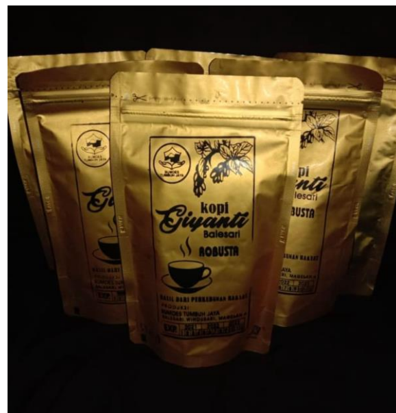
Figure 7. Second alternative is to design a giyanti coffe MSME logo

The second alternative logo design for the UMKM Giyanti coffee product is explained in Figure 7. In this logo design there is an image of coffee and a coffee tree. This indicates that Giyanti Coffee MSMEs really use quality coffee as their raw material. The use of an icon depicting coffee ready to be enjoyed in a traditional cup shows that the production process is still traditional, like a legacy passed down from generation to generation. Apart from that, the second alternative also provides information regarding the type or variant of coffee, coffee images or icons, and addresses of Giyanti coffee MSMEs.