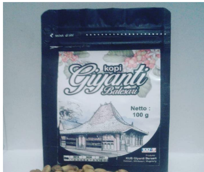
Figure 6. The first alternative is to design a giyanti coffe MSME logo

The second alternative logo design for the UMKM Giyanti coffee product is explained in Figure 7. In this logo design there is an image of coffee and a coffee tree. This indicates that Giyanti Coffee MSMEs really use quality coffee as their raw material. The use of an icon depicting coffee ready to be enjoyed in a traditional cup shows that the production process is still traditional, like a legacy passed down from generation to generation. Apart from that, the second alternative also provides information regarding the type or variant of coffee, coffee images or icons, and addresses of Giyanti coffee MSMEs.