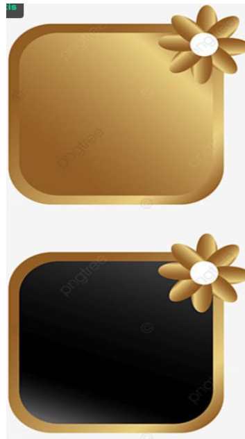
Figure 5. Alternative use of color in logo design

color in designing the product logo is based on references to visual images of giyanti coffe, such as the rich color of the coffee beans, the warm color of the coffee cup, and natural elements related to the coffee farming process. By using a color scheme that matches the image and characteristics of giyanti coffe, it is hoped that the logo can reflect the essence and value of the coffee product. Use color to design product logos based on references in Figure 5.