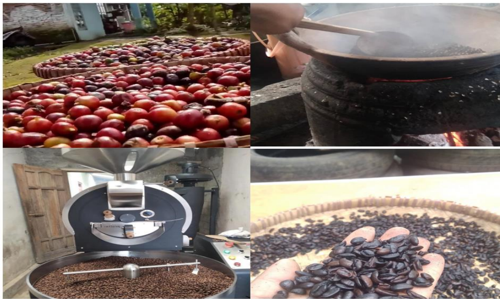
Figure 2. Image of Giyanti coffee production site

Yet, behind these merits lies a primary challenge residing in the product packaging, which has yet to meet industry standards. Insufficient attention to packaging design has hindered efforts in proposition and marketing of this product. In response to this issue, this engagement aims to create a captivating and representative logo for the coffee crafted by the community on the slopes of Mount Sumbing, Magelang. With an appealing logo, it is hoped to enhance the product's allure in both local and international markets, while also establishing a strong identity for this coffee product within the national coffee industry landscape