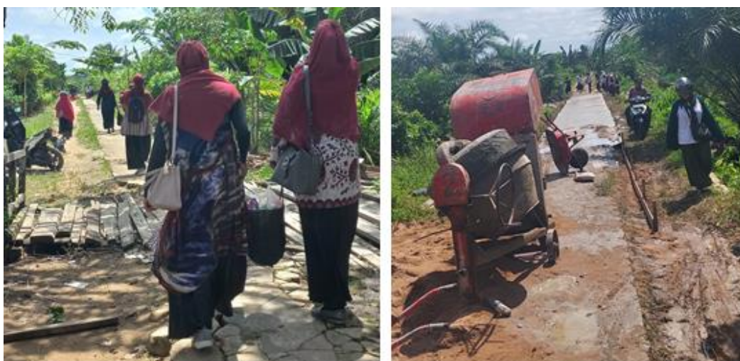
Figure 2 Road access infrastructure to Sungai Asam Village

Sungai Asam Village has public facilities such as roads, waterways, bridges, lighting equipment, electricity networks, garbage disposal canals and so on. In addition, there are social facilities provided by the government such as health centers, clinics, places of worship, markets, recreation areas, playgrounds, sports venues, function rooms, tombs and so on. In terms of the quality of infrastructure development in Sungai Asam Village, it is still uneven, both in terms of public facilities and social facilities. Road facilities in Sungai Asam Village in several villages have not been touched by the construction of asphalt roads. This is because the village fund budget cannot suffice for road infrastructure development. There are 2 access roads in Sungai Asam Village, namely the main road which is part of the regency road and the provincial road. Village roads, known as small ditches, are divided into 43 ditches located in 80 RTs and 12 RWs as well as 5 hamlets. The reach to the ditch roads was split by the Kapuas River. This is what then causes uneven road construction.