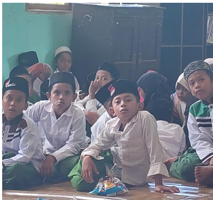
Figure 3 Santri of the Al-Barokah Islamic Boarding School in Sungai Asam Village

The socio-cultural situation of the residents of Sungai Asam 1 village can become a general socio-cultural one, one of which is the culture of mutual cooperation, such as building roads, houses, being active in cleaning, and so on. As for social culture that is religious in nature such as completing the Qur'an, tahlilan, go up (3 days, 7 days, 40 days, 100 days) for residents who died. The form of implementing socio-cultural activities for the residents of the Sungai Asam 1 Village housing complex is very varied.