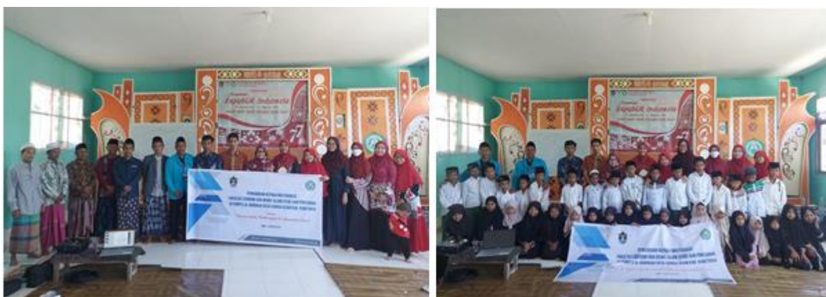
Figure 5 Group photo with residents, students, and administrators of the Al-Barokah Islamic boarding school

The next event was closing with a prayer reading by student representatives, and closing the event by the MC who was a student representative, and a group photo session as documentation by students. And the distribution of gifts to the participants who attended the event.