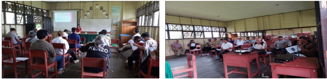
Figure 5. Training, Mentoring and Discussion Activities at Activity Partners

The counseling began with a presentation by the Assistance Team on how to make business proposals and make business financial records. Continued by providing examples of business proposals and business financial recording models to make it easier for activity partners to understand the material provided. After the presentation by the Assistance Team was completed, training and interactive discussions were carried out simultaneously to produce business proposals and good business financial records.