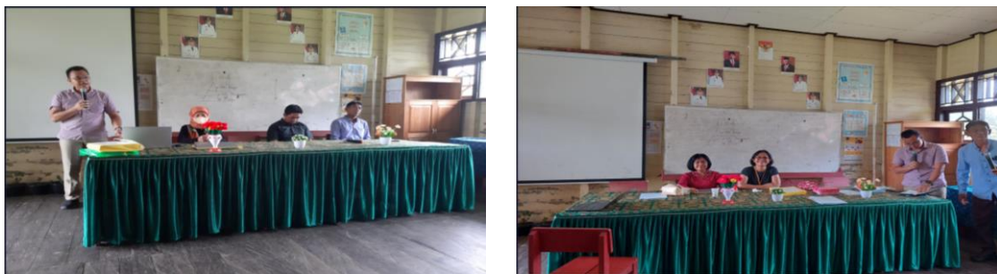
Figure 3. The PKM team coordinates and socializes mentoring activities

The implementation of coordination and socialization for mentoring activities to the community for independent workers in Baun Bango Village, Kamipang District, Kasongan Regency, Central Kalimantan Province, was carried out by the PKM Team at the Village Hall attended by the Head of the Sub-District, Mr. Village Head, and Representatives of Farmer Groups as Partners of the activity. It looks like this in the following figure 3 .