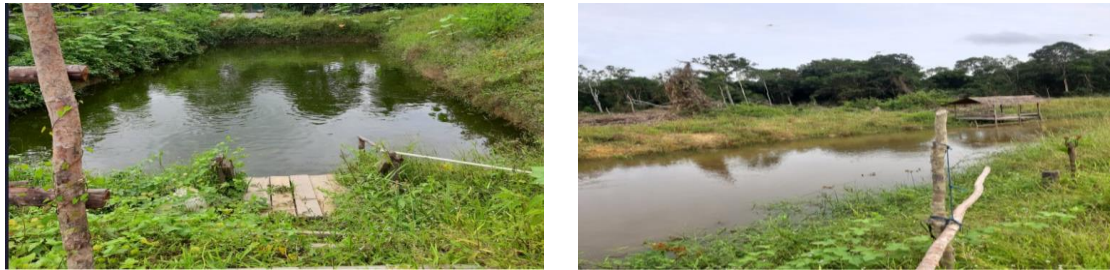
Figure 4. Potential Fisheries Pond Partner Mentoring Activities

Furthermore, the Village Head conveyed that the community of the pond fishery group has owned one fishery pond each which has been managed for almost two years and harvested. Realizing the excellent prospects of the pond fishery business and the availability of large areas of land, the pond fishery group wants to develop its business by adding fishing ponds to improve the economy of group members.. This is by the statement 14 This assistance can develop and strengthen the attitude of economic independence through the entrepreneurial process.