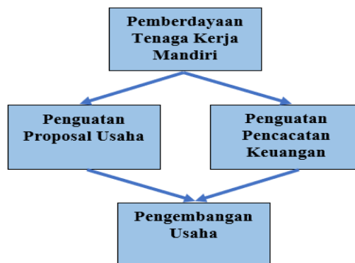
Figure 2. Flow of Thought of Independent Workforce Assistance Activities

The stages of the activity are as follows, namely (1) Socialization of the program which was attended by 20 members who were representatives of 10 activity partner groups in Baun Bango Village, Kamipang District, Kasongan Regency and was also attended by the Head of Baun Bango Village at the Village Hall at the beginning of the activity, (2) Counseling was carried out by means of direct communication with 20 group representatives from the activity partners and continued with interactive discussions with material strengthening business proposals and strengthening business financial records, (3) Training which was attended by 20 group representative members who became activity partners with material including introduction, techniques, and practices directly both for making business proposals and making business financial records as reinforcement, (4) Assisting directly with 20 members who are group representatives from 10 (ten) groups that are activity partners for strengthening proposals business and strengthening of business financial records. The train of thought of independent labor mentoring activities is shown in the following figure 2.